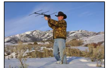
Bird on ground