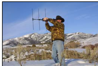
Bird on perch

The signal from the PowerMax is strongest if the receiver antenna is lined up in the same orientation as the PowerMax antenna. Since a falcon on a perch keeps its tail almost vertical, you will get the best signal if you hold your receiver antenna with its elements vertical. However, there are some cases, such as when the falcon is on a kill, when the transmitter's antenna could be nearly horizontal. In such a case, hold your receiver antenna horizontally.